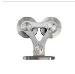
SS-TMDW-65 Dual Wheel