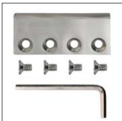
SS-FR-C Flat Rail Connector