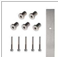
SS-FR-65 (pack of 5 pcs) SS-FR-65-A (pack of 1 pc)