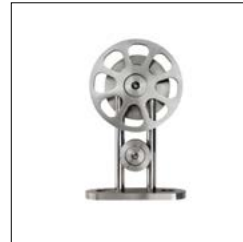
SS-TMSW-65 Spoke Wheel