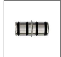
SS-RR-C Round Rail Connector