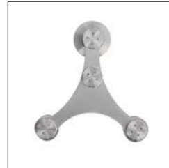
SS-FMST-65 Strap Triangle