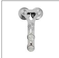
SS-FMDW-65 Strap Dual Wheel