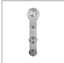
SS-FMSS-65 Strap Stick

*Carriers shown to represent kit style, not sold separately