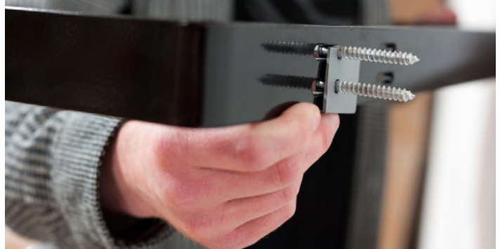
PHOTO C - SPACER FOR STEEL SHELF SYSTEM ONLY.