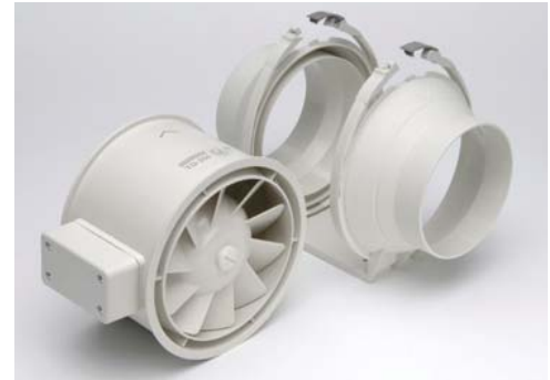
Internal parts can be easily removed for mounting & servicing

The TD ventilation kits enable the simple and fast installation of a complete ventilation system. The kits include the powerful TD in-line fan providing efficient extraction for bathrooms, toilets, washrooms and any other applications that require the removal of bad odors, stuffy and humid air. In addition to the fan, the kits include an interior round air valve (BOC/BOR-100); exterior mounted grill (GR-100); ten feet of flexible aluminum ducting (GSA-100) and a roll of tough ducting tape to provide the complete hardware required for a given ventilation system.