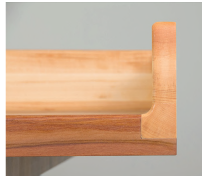
COVED RISER (FRONT VIEW)