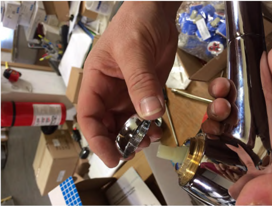
4. plug in the handle