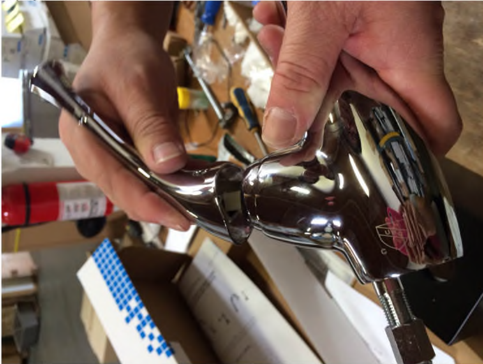
5. use the below tool the twist screw inside the hole