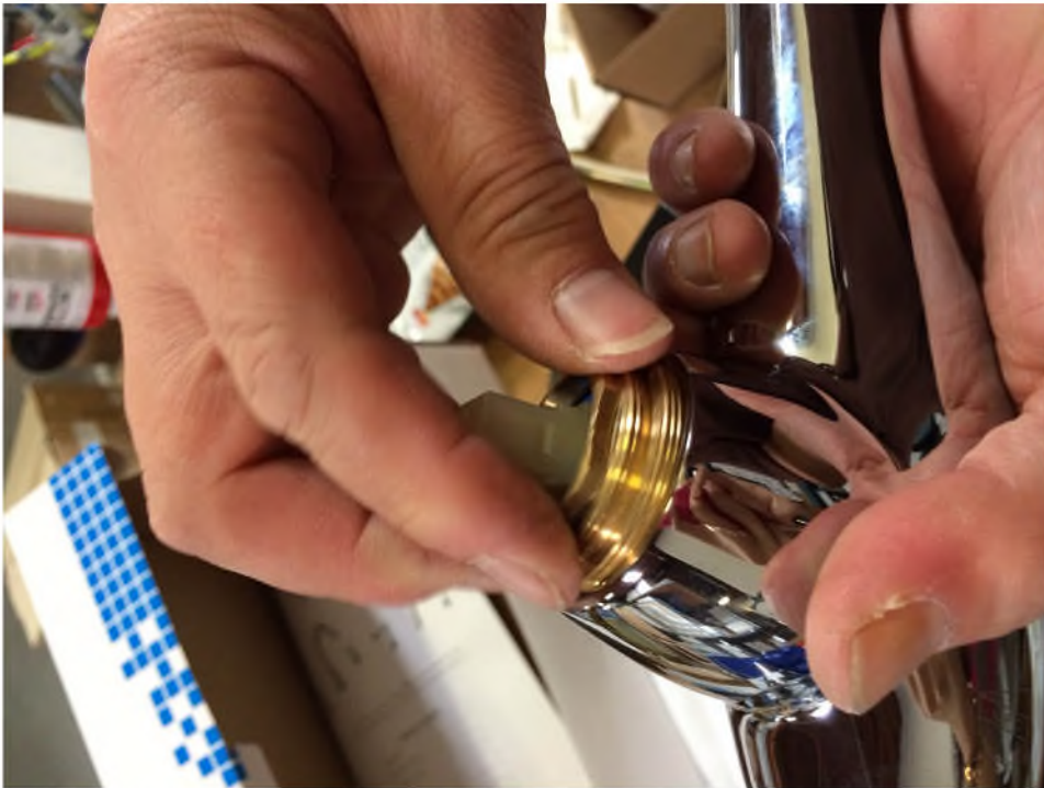
3. twist the silver vover on the gold ring