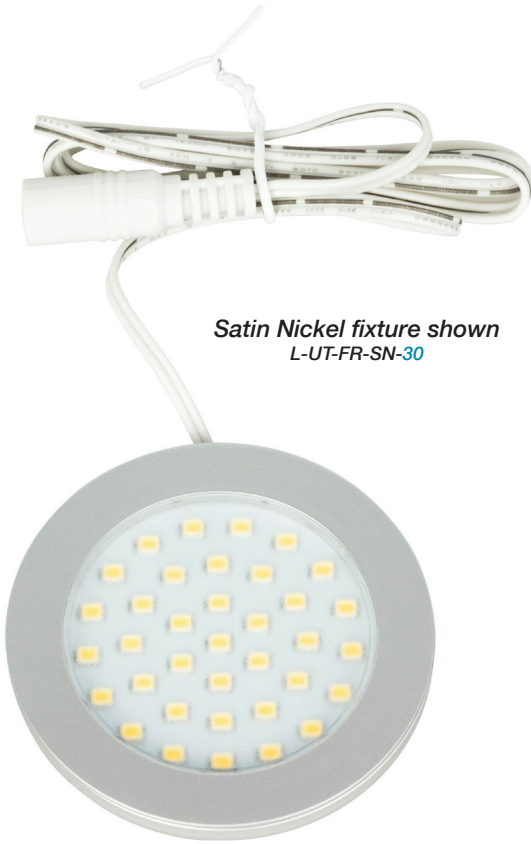
Satin Nickel fixture shown L-UT-FR-SN-30