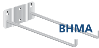
P1198 Double Prong Utility Hook