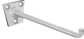
PKV3 Heavy-Duty Single Prong Utility Hook