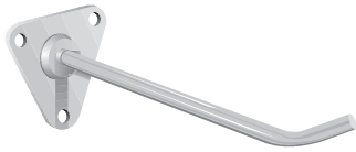
1132 Single Prong Utility Hook