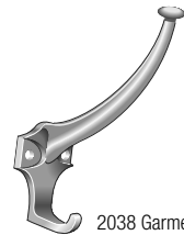
2038 Garment Hook

Knape & Vogt reserves the right to change product specifications at any time without notice and without incurring responsibility for existing units. This information conforms to editorial style prescribed by The Construction Specifications Institute.